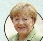
Angela Merkel Germany