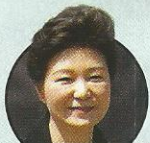
Park Geun-hye South Korea

SOURCE: INTER-PARLIAMENTARY UNION, SEPTEMBER 2015