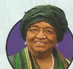
Ellen Johnson Sirleaf Liberia